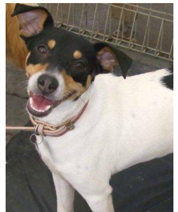
Pluto Pup 7mths Mini Foxy x 5.2kgs A snuggly, playful & very sweet boy.