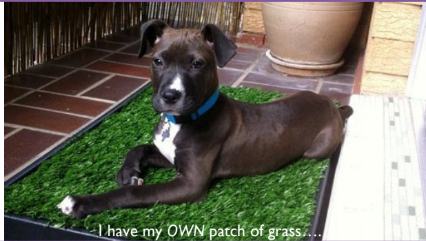
I have my OWN patch of grass....