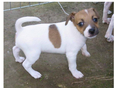
Foxys are very cute puppies