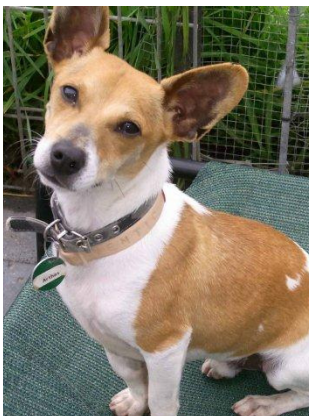
Arthas Mini Foxy x 1yr 4.5kgs A gentle, active & playful boy. Try to resist....

We think she is cute regardless of fashion – don’t you?