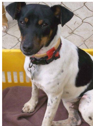
Terry Tenterfield Terrier x 7mths 6.4kgs A loveable, tail wagging, fun boy.