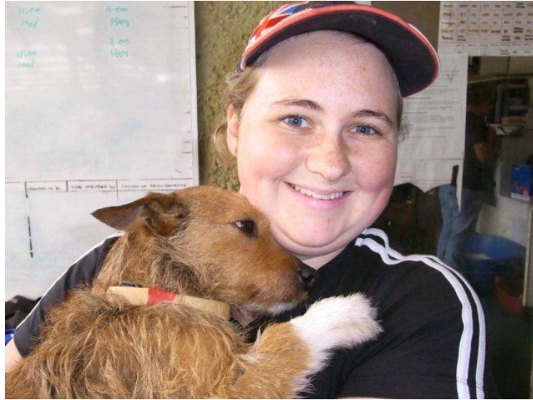
Armin Terrier x 6yrs 7.5kgs Male He is a sooky, cuddly boy who needs to feel safe after the trauma of the pound!

Armin, pictured with me, just wanted to snuggle in my arms and be comforted. He is such a gorgeous, gentle boy and I cannot image how fearful he must have felt being abandoned by his family and sent to the pound.