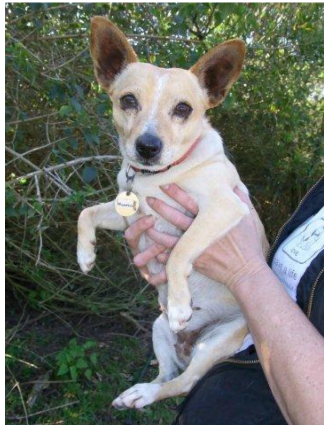
Rumour Chihuahua x Foxy 6yrs 6kgs Female. She needs and deserves a home of her very own.

PERHAPS ONE DAY RUMOUR, a little girl lost, WILL BE FOUND!!!