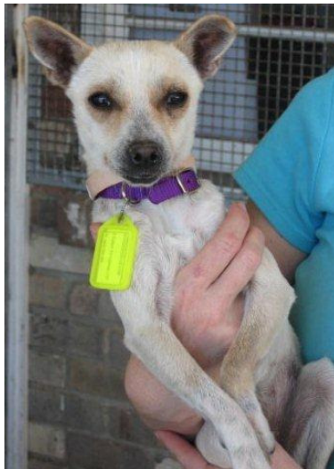
Sisters Demi & Rumour, pictured on their first day at DR in 2007