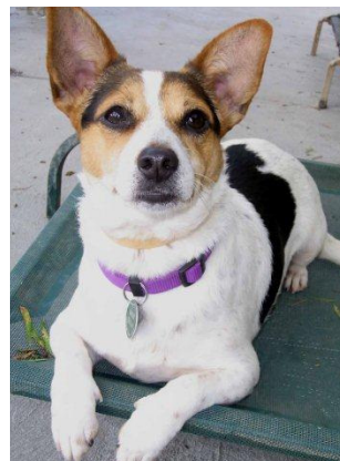
Molly Foxy x 1yr 7kgs A happy, gorgeous girl—suit a fun family! Loves cuddles...